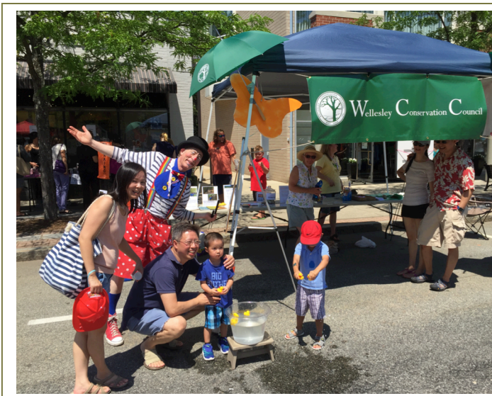
Visit our information table at July Jubilation and Farmers' Markets