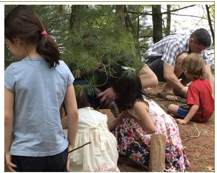
Come to Pickle Point and build a woodland troll and fairy house