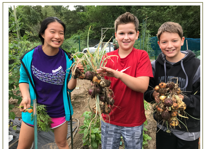
Exploring the community gardens at the North 40 during EcoCamp

Fifteen middle schoolers took part in the Council's first ever EcoCamp—a one week outdoor program to engage Wellesley youth in the wonders of the natural lands and water in Wellesley's own sanctuaries. Held in partnership with the Youth Commission and the Natural Resources Commission, the kids fished with an instructor on Sabrina Lake, learned tree identification at Guernsey Sanctuary, helped harvest weeds on Morses' Pond, toured the water filtration plant, built wilderness shelters and learned orienteering at the North 40, participated in Broadmoor's nature discovery program, and so much more!