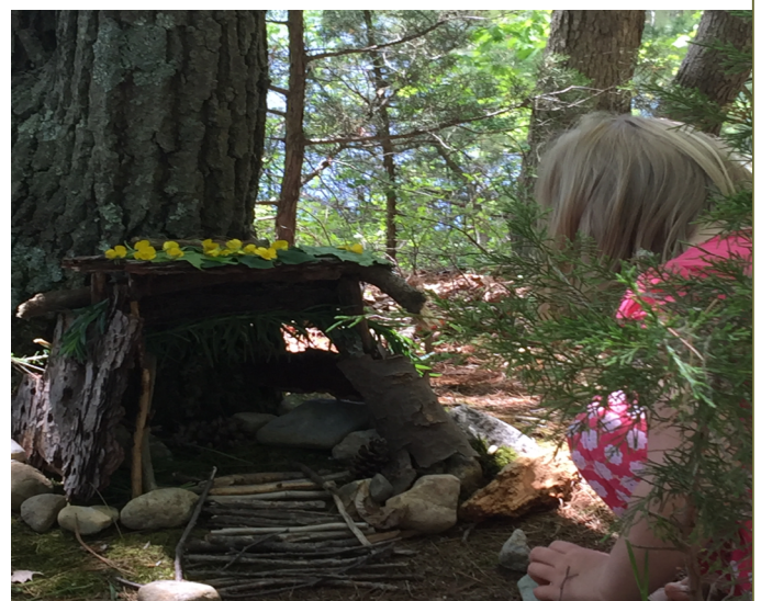
Come to Pickle Point and build a woodland troll and fairy house