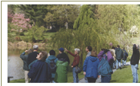
We held six bird walks in May and June. Come and join us again in 2016!

The Council's "Walks in Wellesley" publication provides maps and descriptions of the best places to explore including Guernsey Sanctuary, Susan Lee Memorial Sanctuary, Waban Arches, Fuller Brook Path, Beebe meadow, Cronk's Rocky Woodland, Pickle Point, and many more. Buy one for your family at Wellesley Books.