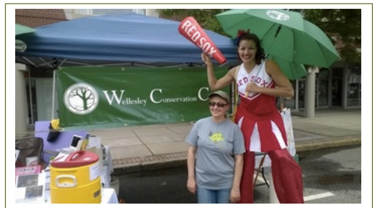
Cheering for the Council's mission at our July Jubilation info table

We were pleased to invite and share our tent with our friends at the Wellesley Historical Society and Wellesley Trails Committee.